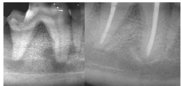
Left: Pre-op radiograph of a fractured lower right 1 st molar with septic pulp necrosis and infection in bone around the root tips.